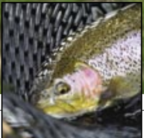
"WEEKEND WARRIORS" CROW NATION RESERVATION: BIGHORN RIVER, 2007