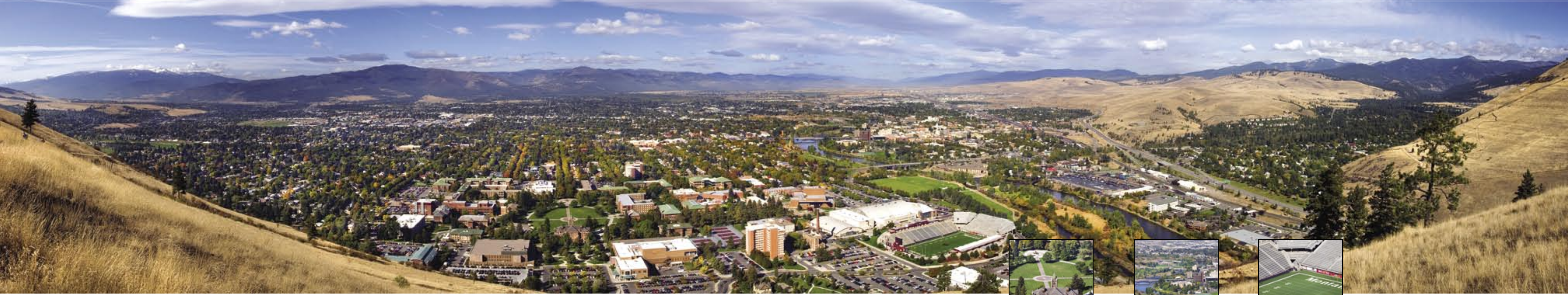
"MOUNT SENTINEL" MISSOULA, 2007