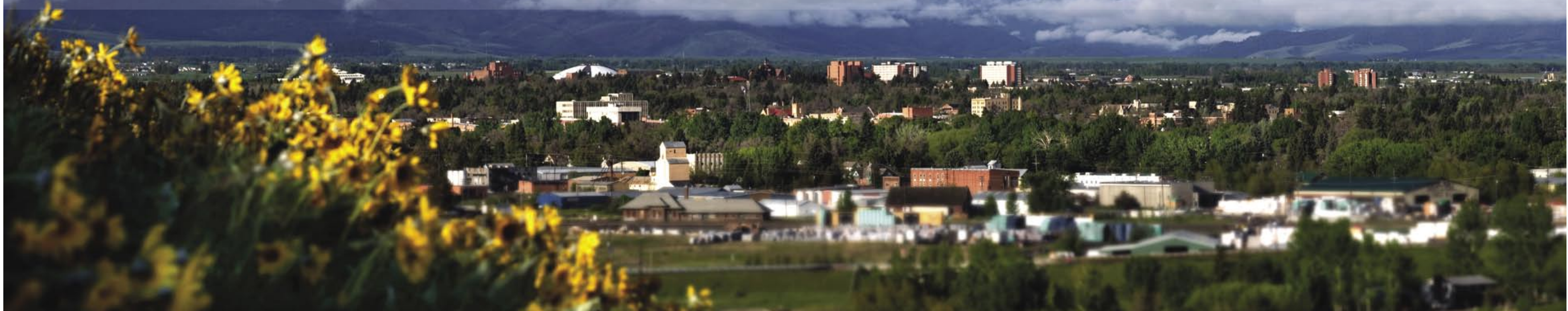
"VALLEY OF FLOWERS" BOZEMAN, 2005

©2007 Great Wide Open Publishing Copyrighted Material