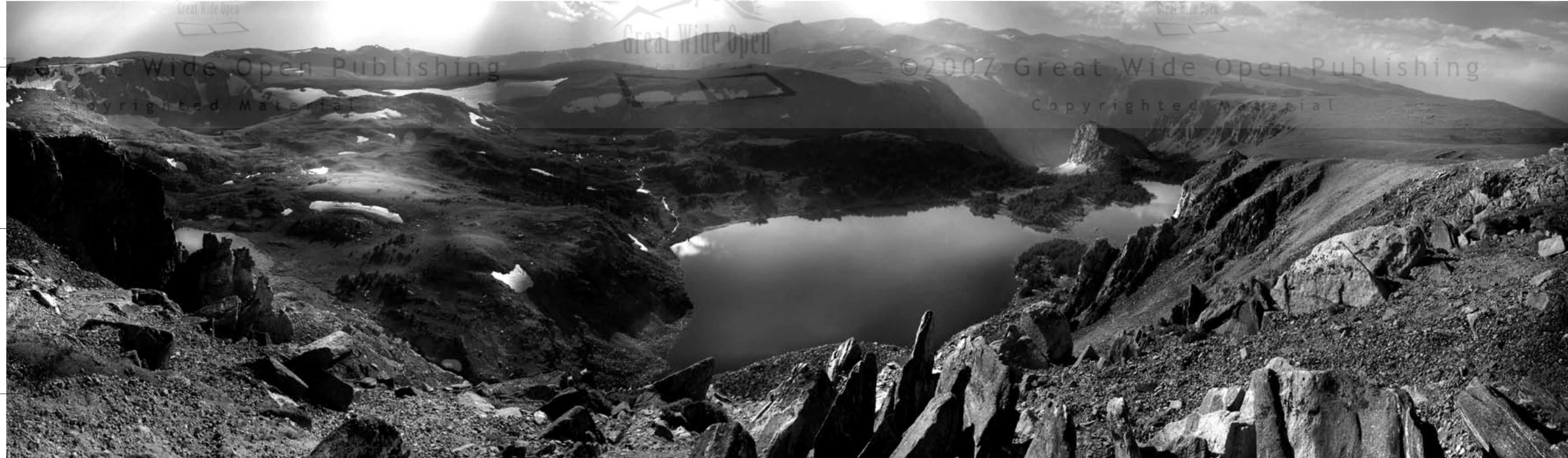
"HELLROARING LAKES" BEARTOOTH PLATEAU, 2006