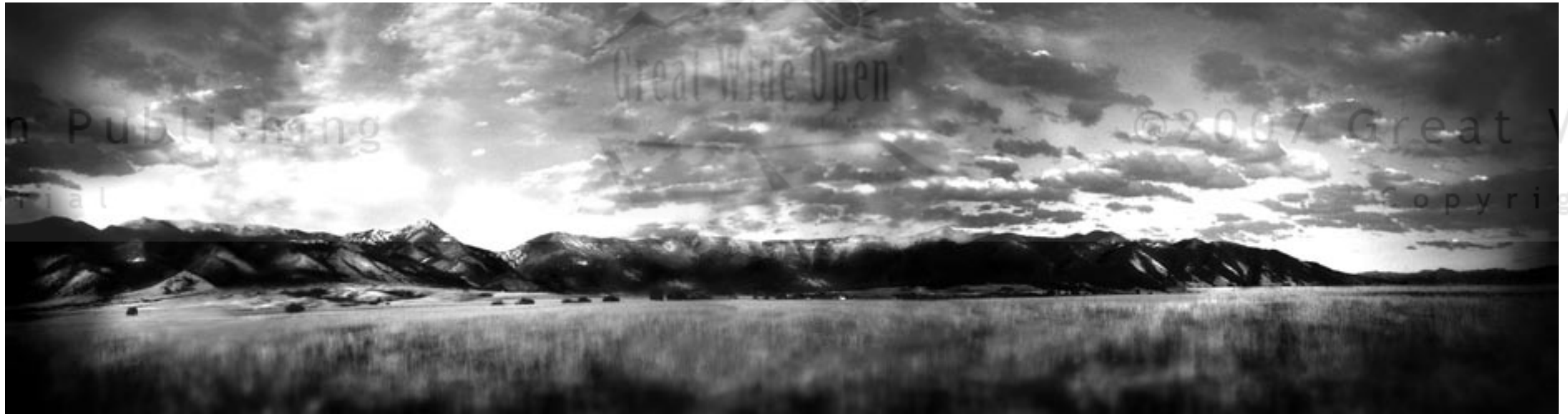
“ROSS PASS” FIRST PANORAMIC, 8 EXPOSURES LAYERED BY HAND FROM SLIDES: BRIDGER RANGE, 1997