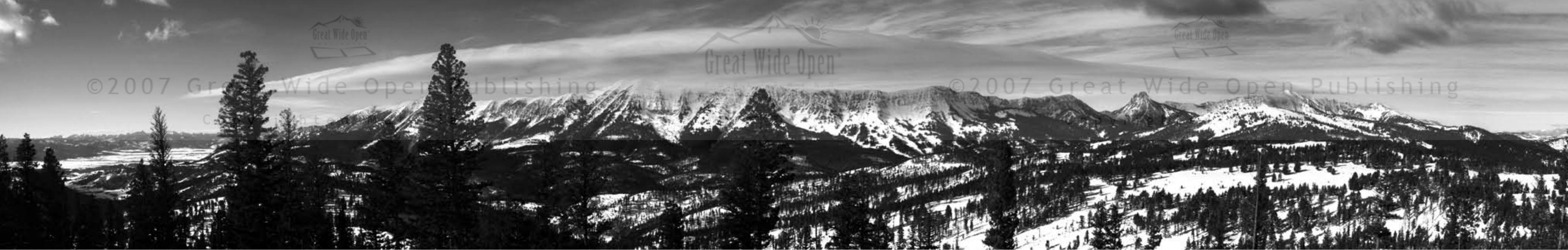
“RIDGE CLOUD” BRIDGER RANGE, 2005

Library of Congress Cataloging-in-Publication Data: